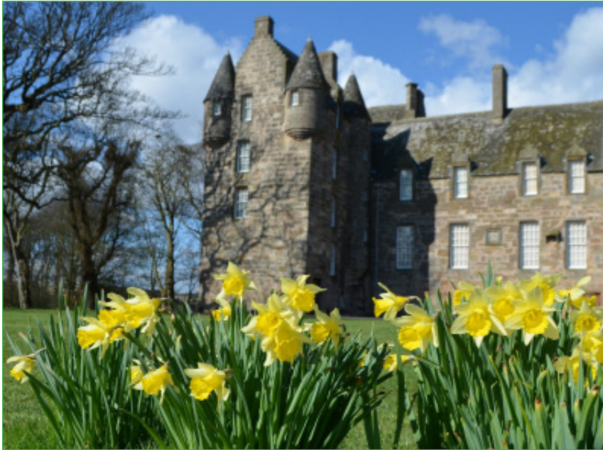
March daffodils at Kellie Castle near Arncroach in Fife

Torrance Cultural Arts Center, Torrance Blvd. at Madrona Ave.