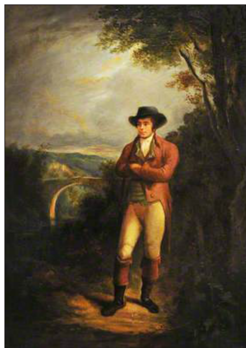
1828 posthumous portrait of Robert Burns by Alexander Nasmyth

Theme: Robert Burns song "Rantin' Rovin' Robin"