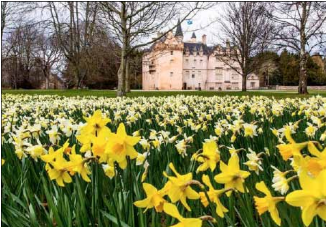
March daffodils at Brodie Castle near Forres in Moray

Torrance Cultural Arts Center, Torrance Blvd. at Madrona Ave.