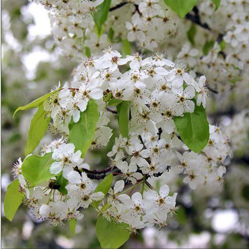
Flowering evergreen pear ( Pyrus kawakamii ) blooms profusely all around Southern California in February.